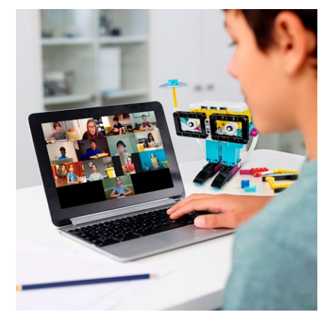
We're here to support teachers in the classroom with a range of resources like hygiene guidelines, best practices, and tips for keeping learning hands-on in the era of physical distancing.

Whether in person, at a distance, or a combination of the two, let learning happen anywhere with help from our adaptable solutions, lessons with support for hybrid learning, inspirational guides and more.